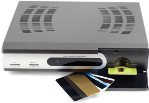
The analog sunset does not apply to cable and satellite TV set-top boxes.

services such as Apple iTunes® that offer protected content for download or streaming, may require limitations on analog outputs. But this would depend on the policies of the particular service in question, and whatever agreements the service has with content owners such as the Motion Picture Association of America - MPAA.